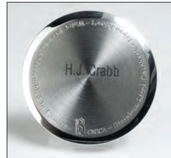
Case Back Engraving

Citizen Quartz models have some space available around their copy information, for logos and/or type. The gent's models have room for up to 3 lines of engraving, up to 7 characters per line. The lady's styles also have room for up to 3 lines , but a maximum of 5 characters per line.